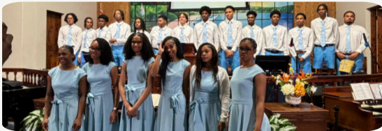
Bermuda Institute Grade 12 Senior Class

The Senior Class Presentation is a sacred milestone that celebrates our graduates' academic achievements and spiritual growth. Rooted in the philosophy of educating the "whole person," the ceremony honors the students' journey of faith, while challenging them to live a life of service and mission. It is a time for our seniors to reflect on their transformation, express gratitude to the families and mentors who supported them, and formally commit to using their talents for God's glory as they step into their future.