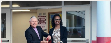
Honourable Zane De Silva, JP MP, Deputy Premier and Minister of Housing & Municipalities Honourable Crystal, JP, Minister of Education

Bermuda Institute proudly hosted this year's Science Fair under the theme "Inventions Through the Years: 19th and 20th Century Showcase." This engaging, school-wide event highlighted the creativity, curiosity, and innovation of our students as they explored groundbreaking inventions that have shaped the modern world.