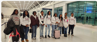
Bermuda Institute students who attended Academy Connect

Ultimately, Academy Connect aims to inspire a new generation to live boldly for God, equipping them with the character and skills needed to grow His kingdom